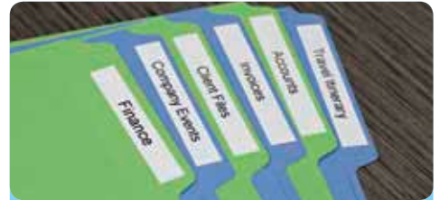
Ideal for file folders & binders