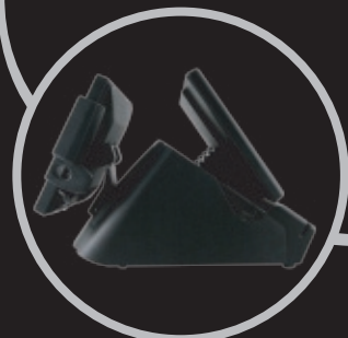
With 2nd display LCD