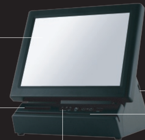
System and printer status LEDs, power switch, brightness control buttons