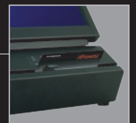
Built-in magnetic stripe reader (MSR)