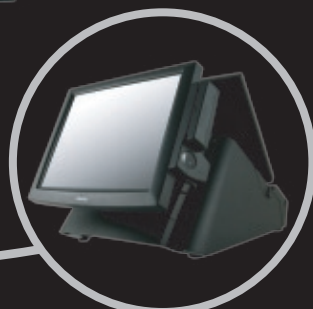
With MSR and finger print sensor