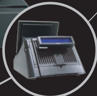
With rear mounted customer display