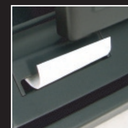
3" thermal printer with auto cutter